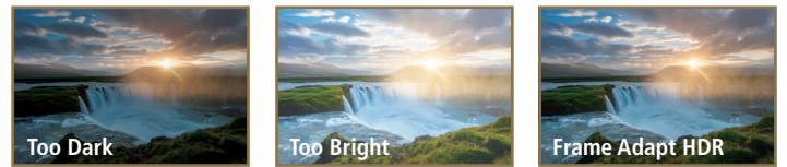
JVC projectors featuring Frame Adapt HDR and Theater Optimizer can express HDR content at optimum brightness and darkness in each frame as the creator intended.

The DLA-RS3100 is compatible with HDR10 content such as UHD Blu-ray and streaming. Color grading of HDR content can vary dramatically. Frame Adapt HDR dynamically tone maps all HDR10 content for optimized brightness, color and detail on a frame by frame or scene by scene basis. With Theater Optimizer, JVC has created the world's first projector that automatically fine tunes HDR based on installation characteristics, and projector settings.