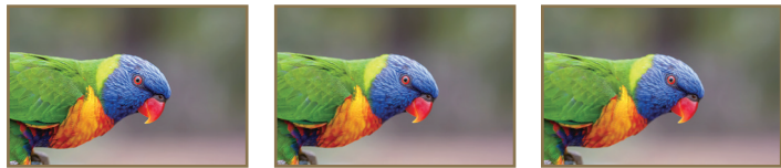
See how the native 4K image becomes sharper with 8K e-shift processing, and as if it is alive with 8K e-shiftX processing.