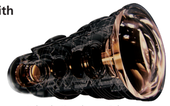
High-quality 65 mm diameter, 17-element, 15-group all glass lens

The DLA-RS3100 is equipped with a 65mm diameter, high resolution, 17 element, 15 group all glass lens to deliver 8K resolution on the screen. For excellent installation flexibility, a wide shift range of +/-80% vertical, +/-34% horizontal is offered.